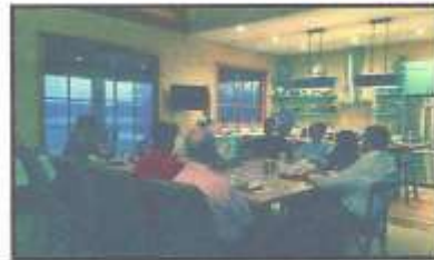
At long last: "Our Board.." Pg. 5