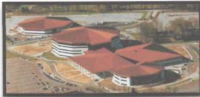
Southeast Christian/Blankenbaker campus